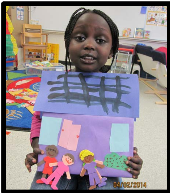
"My building is a nice house that has shingles on the top and it's neat to be like this and it's so people can see other people inside the house (window). It's pretty and it's good. That's all my house has."

This is the castle where the king rules near the cave where the monster sleeps beside the army place where the tanks can park in the city that we built.