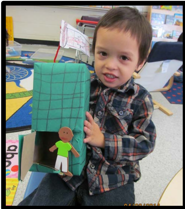
"Place for soldiers and for tanks. Tanks go in there. Soldiers go in there. That soldier goes in there. See he's standing up. Look it. Look at this a red for Canada."

This is the castle for the queen next to the house with the windows to peek to see the king in the castle near the cave where the monster sleeps beside the army place where the tanks can park in the city that we built.