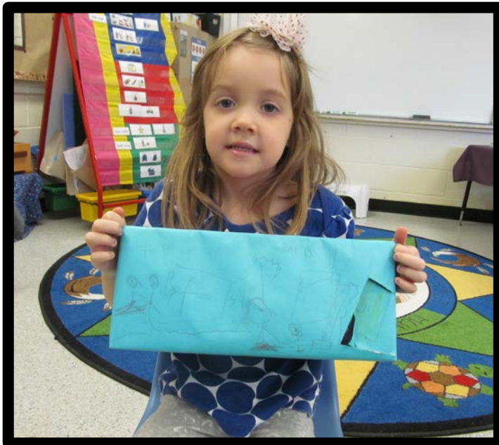
"This (pointing to address). It's a number. It's on a hill. It's a house. That is my Mommy and that's my Daddy. My little sister's right there."

This is the house that shines bright orange behind the castle where the mermaid swims across the lake to reach the airport where the helicopters fly over the house for the police close to the mall where there was a fire across the street from the army base where the soldiers march to the castle for the queen next to the house with the windows to peek to see the king in the castle near the cave where the monster sleeps beside the army place where the tanks can park in the city that we built.