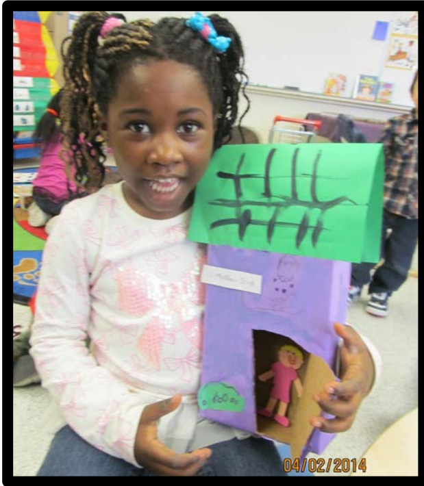
"It's a building. A princess building."

This is the castle for the queen next to the house with the windows to peek to see the king in the castle near the cave where the monster sleeps beside the army place where the tanks can park in the city that we built.