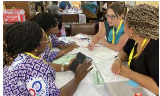
Planning session with our co-tutors.

Project Overseas gives individuals an opportunity to make a difference in the professional lives of teachers and the education of students in developing countries. Project Overseas is a challenging assignment in which you must invest both your time and knowledge, but it pays tremendous dividends for one's personal and professional enrichment and changes your life forever!