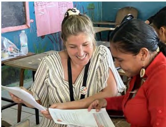
Working together to create a learning improvement plan.

Project Overseas was an experience I will never forget. An experience I will remember while I am teaching a class. An experience I will remember while making a decision for my school. An experience that has left a mark on my heart – in turn making me a stronger educator.