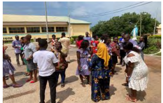
We are using a discussion strategy used in STF PL sessions entitled Inside Outside Circle.