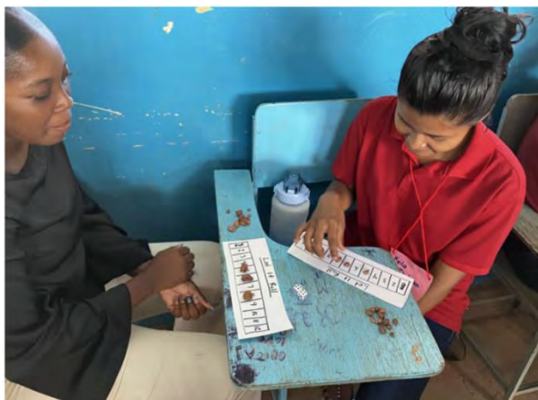
Playing math games.